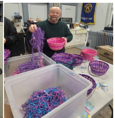
Queens West PRIDE Easter Project