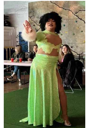
Queens West PRIDE's First Drag Show