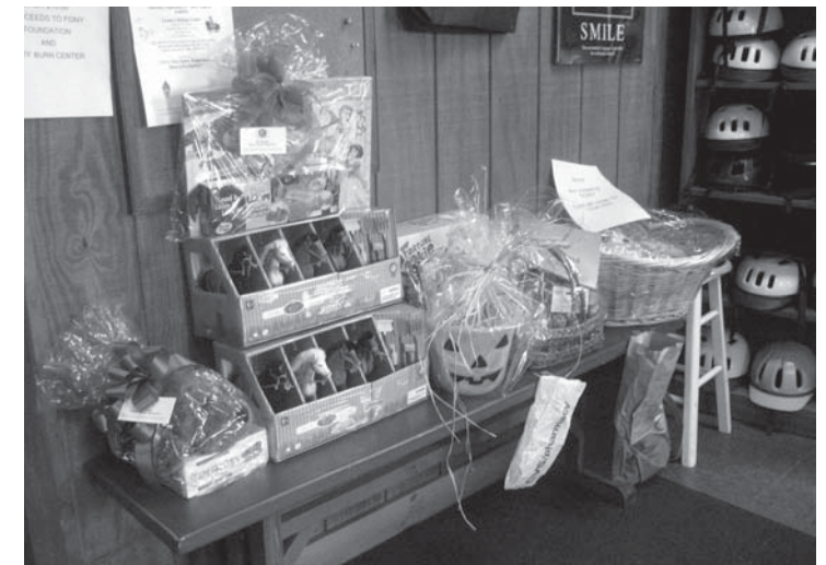
Many prizes at the Pony Raffle to benefit FDNY FIRE SAFETY EXPERIENCE AND THE FDNY FIREFIGHTERS BURN CENTER FOUNDATION