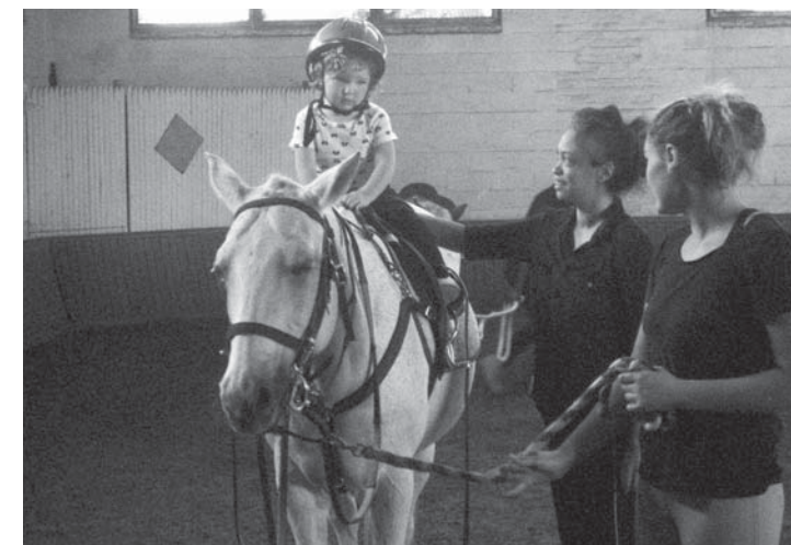
The expression of learning are on the children's faces as they left the stable while riding Pop Corn.