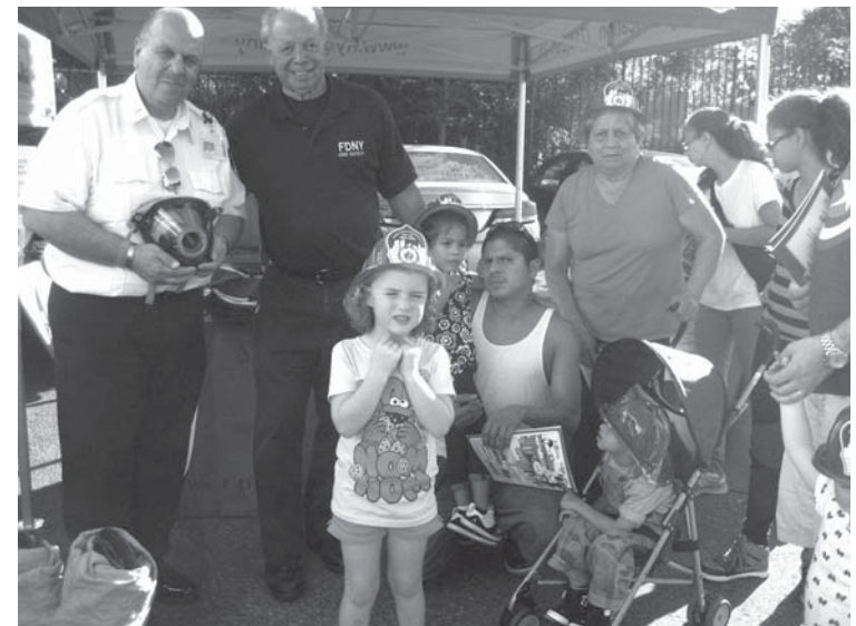
Children enjoying the FVNY Fire Safety Experience in conjunction with the Kiwanis of Middle Village Pony Ride Fund Raiser at Lynne's Riding CENTER

On September 27th the Kiwanis Club of Middle Village once again held a Horse & Pony Ride Fundraiser at Lynne's Riding Center in Forest Hills. Along with a $10 pony ride and raffle ticket prizes, this year's event included the FDNY's Fire Safety Experience with children given fire hats, and coloring books, while they and their parents experienced the how tos on being safe in a fire. This was the third annual Horse & Pony Ride Fundraiser the club has conducted, thanks to Corporate Sponsor Lynne's Riding Center's generosity, and it was, as usual, a big success, with this year's event benefiting both the FDNY Foundation and the NY Firefighters Burn Center Foundation. Both organizations distributed pamphlets to both the children and the adults. Some of the children had never been on a horse before but they quickly got into it and their smiles and pleasure from both the ride and the Fire Safety Experience was rewarding indeed