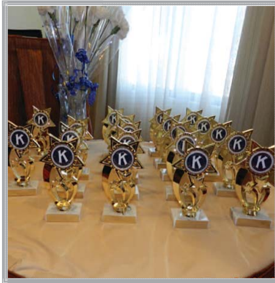
“Celebrating 25 Years of Women in Kiwanis” - “Trailblazer Award Recipients”